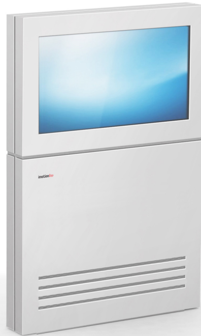
imotion LITE 46 Landscape

* For available add-on options please see add-on segment