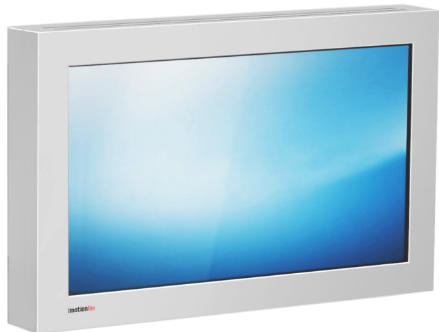
imotion LITE 46 Landscape Wall-mount