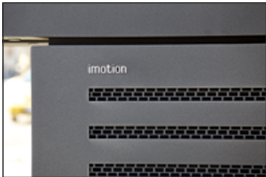
Front Landscape mask with imotion logo