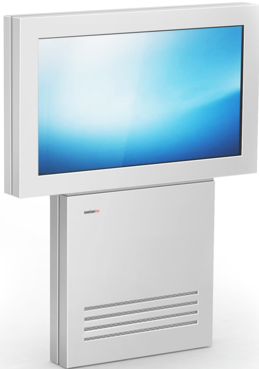
imotion LITE 65 Landscape

Landscape and portrait oriented single sided and wall-mount options, enable covering of wide variety of semi-outdoor locations, such as metro stations or entrances of office buildings. These systems are a cost effective alternative of large format outdoor displays.