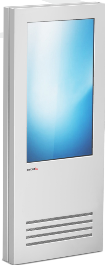
imotion LITE 55 Portrait

A set of heating/ventilating technology based semi-outdoor set of displays delivering highest Full HD resolution images in high ambient light locations, influenced by outdoor environment factors such as cold, heat, dust particles and fluctuation in temperature. Although not as nearly as powerful as imotion outdoor, it is nevertheless a great choice for sun protected outdoor areas, such as entrances to buildings and roof covered locations. Its slim, minimalistic design can invigorate number of areas and is available also in portable mode.