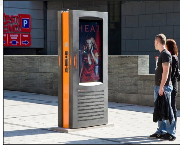
imotion HELP 52 Double Sided Portrait WestEnd City Center entrance in Budapest, Hungary