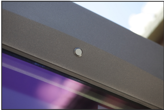
Audience measurement IP camera detail

All of our products are designed to be subtle, non-intrusive and yet impressive urban furniture element. The main idea is to deliver to the market not “only” a reliable outdoor display system, but furniture element complementing any environment. We believe our customers cherish their environment and need well designed display system that can present aesthetic addition. imotion can be modified as decorative masks can be redesigned, re-colored and logos can be added, all in accordance with customer requests.