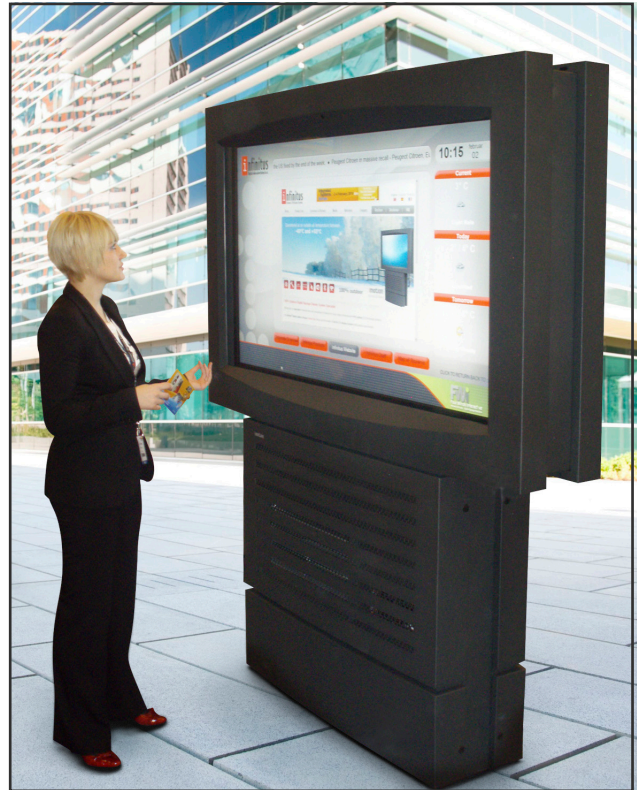
Touch screen 65" landscape application