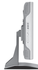
▲ Slim design