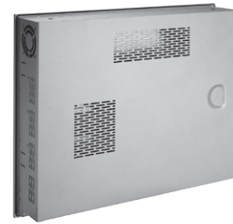
▲ Less screw design