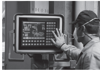
▲ Ideal for factory automation & self-service kiosk in retail