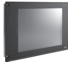
▲ Touch without keypad version