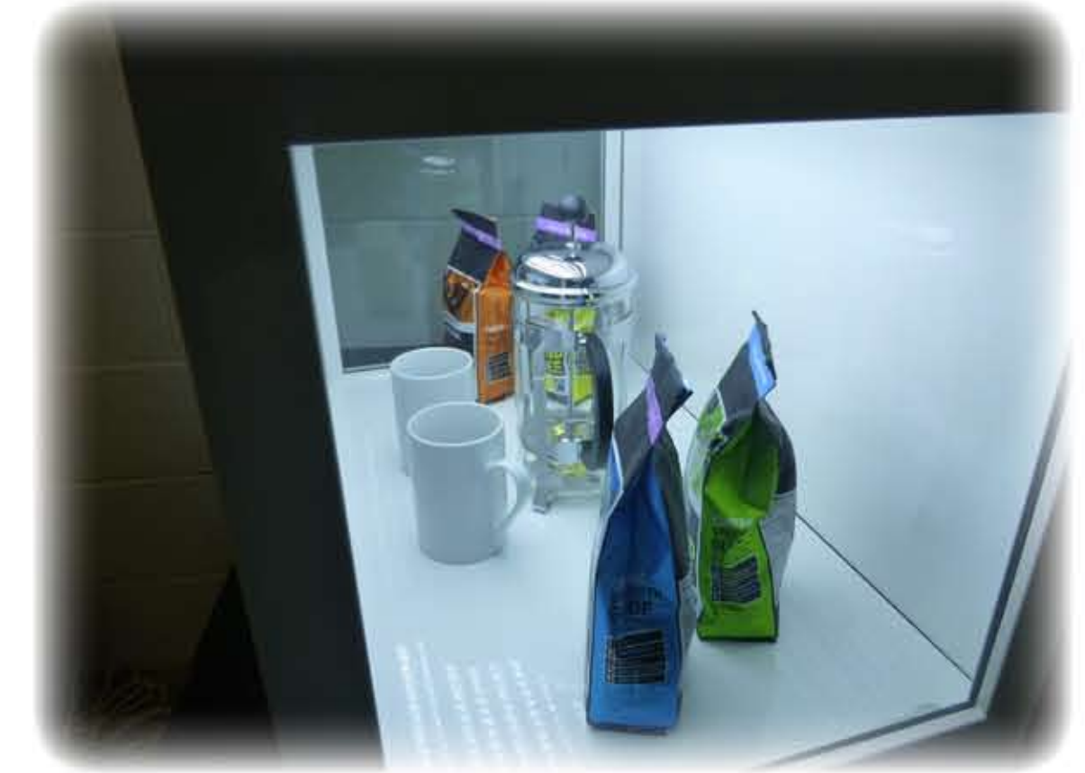
Dual Sided Viewing Windows

Inspire your customers with this unique and innovative transparent showcase display. Mix Rich Digital Content with physical product to create an immersive customer experience.