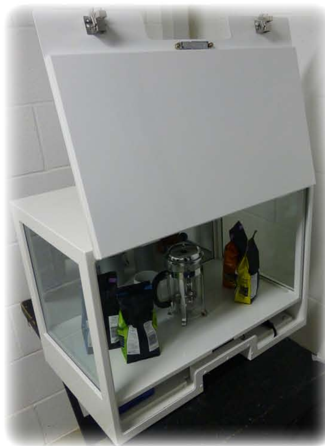
Lockable Rear Access Door

Internal Media Player as Standard, with PC available as an added Extra