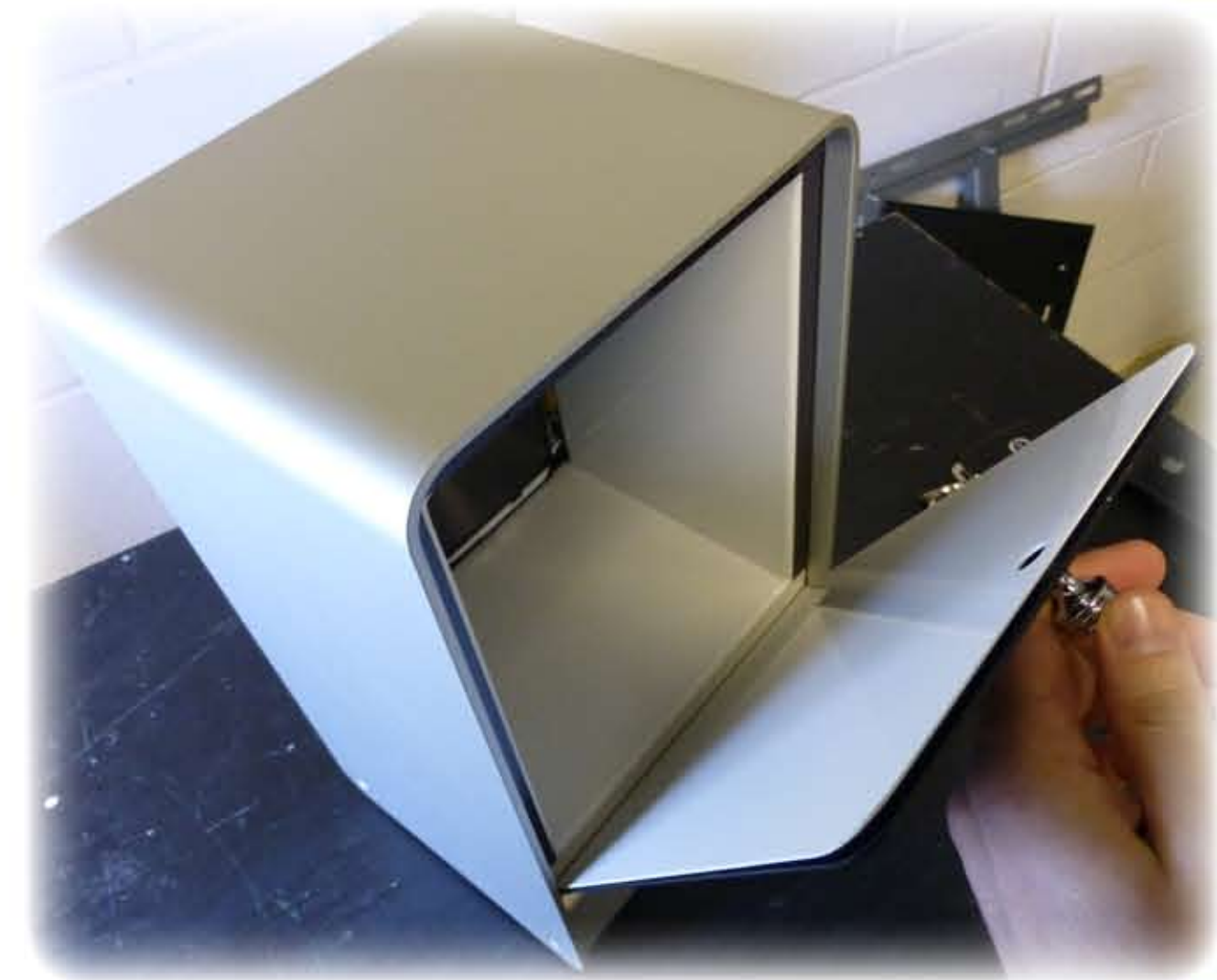
Magnetic Rear Cover

Inspire your customers with this unique and innovative transparent showcase display. Mix Rich Digital Content with physical product to create an immersive customer experience.