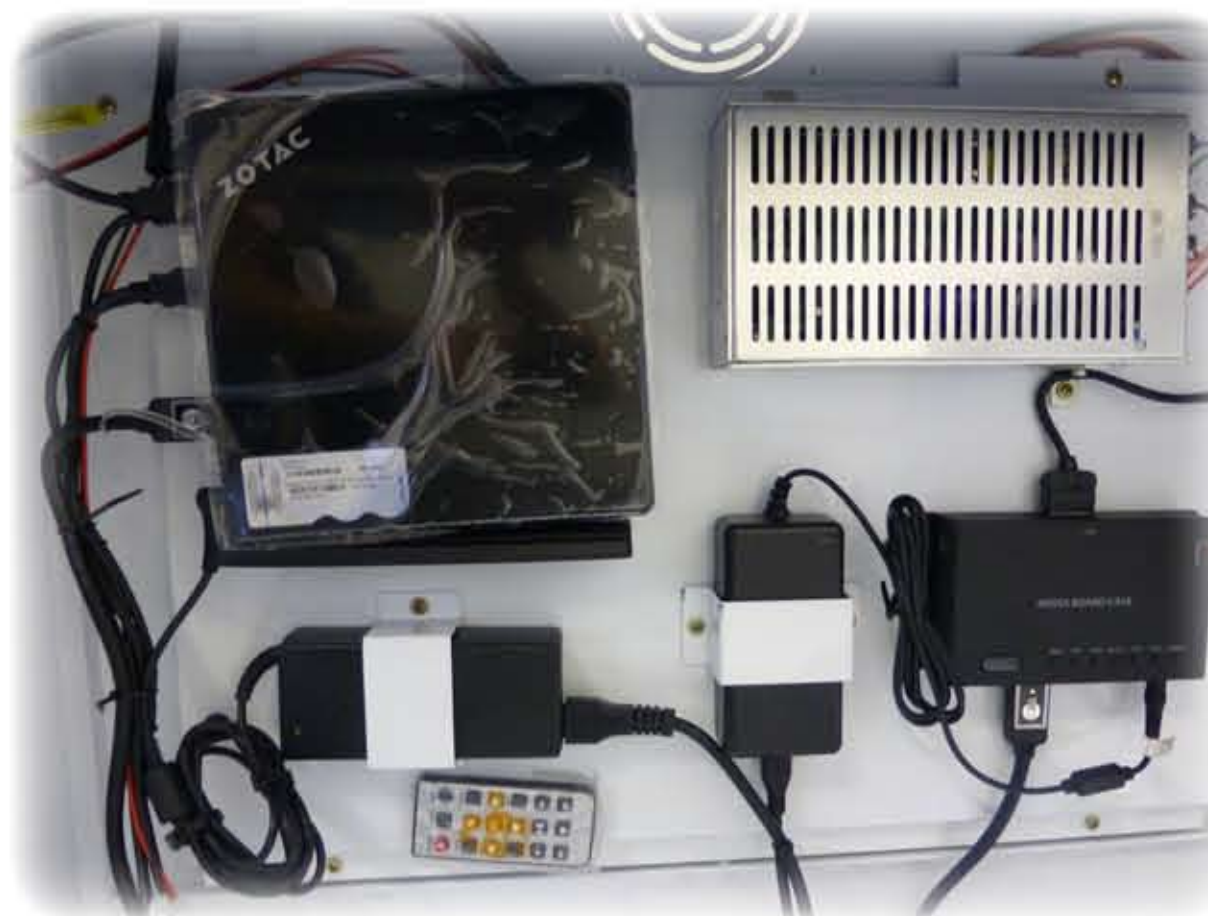
Internal Media Player as Standard, with PC available as an added Extra

Easily Accesible Front opening door. Integrated LED Lighting