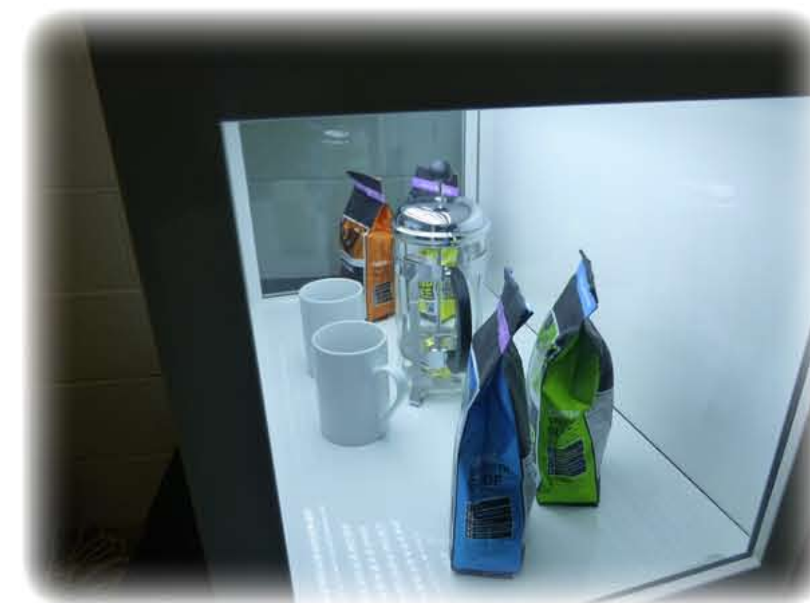
Dual Sided Viewing Windows

Inspire your customers with this unique and innovative transparent showcase display. Mix Rich Digital Content with physical product to create an immersive customer experience.