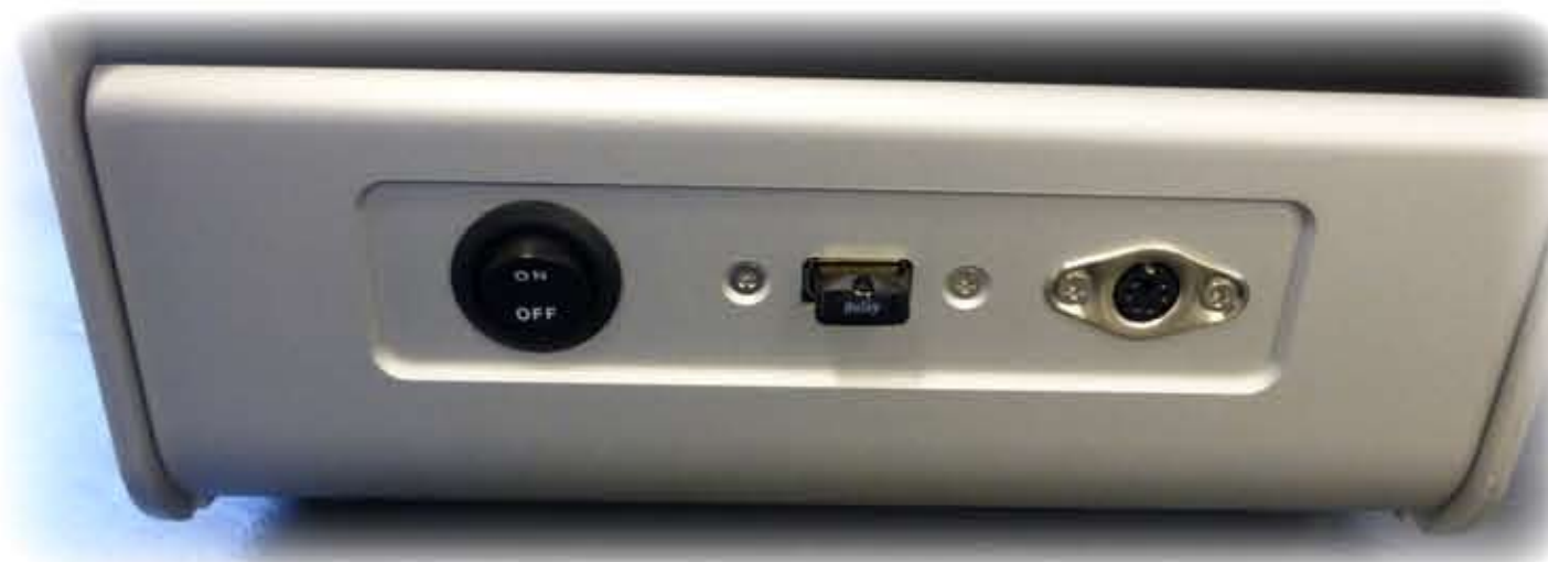
Built in USB Media Player