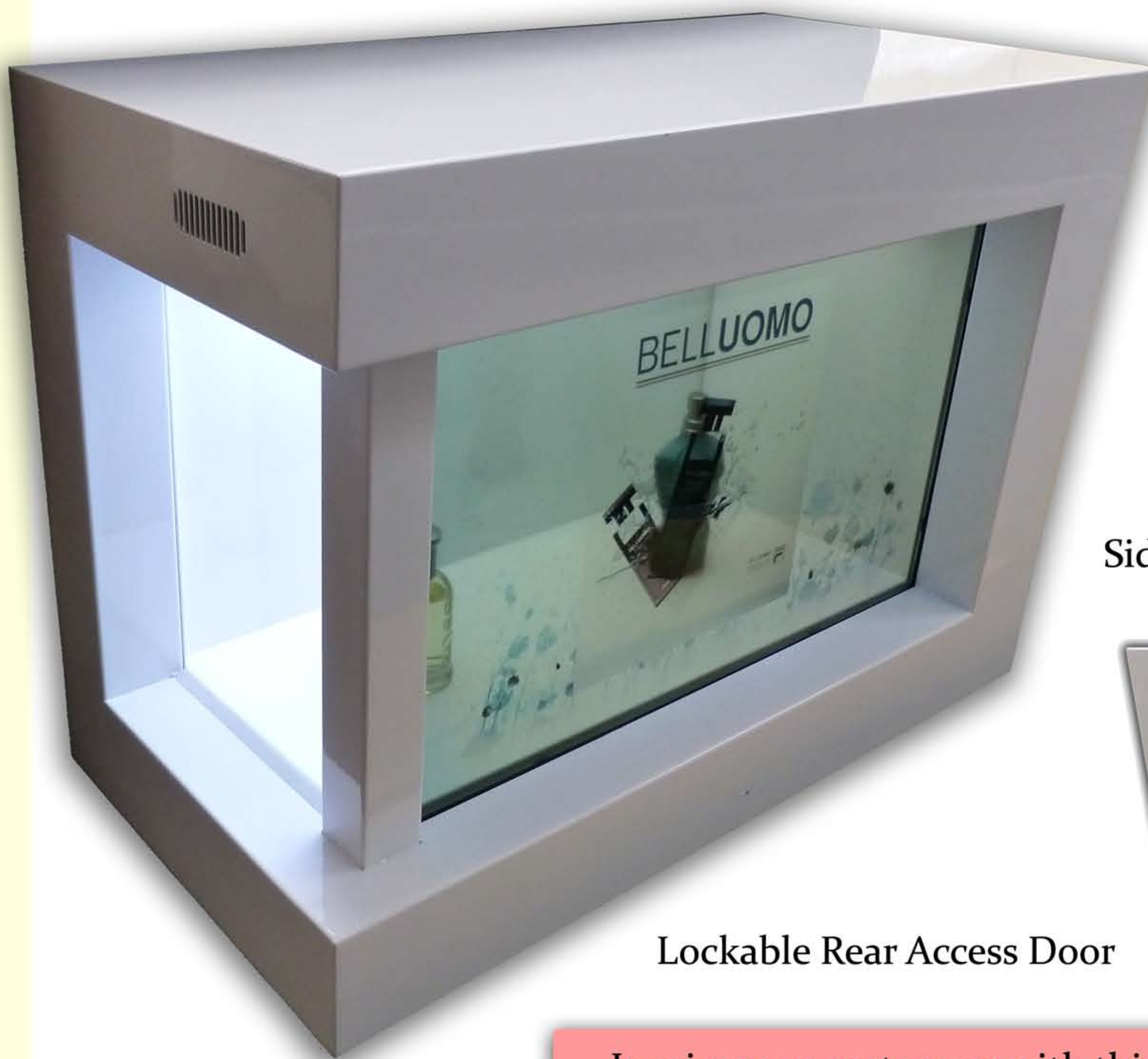
Lockable Rear Access Door