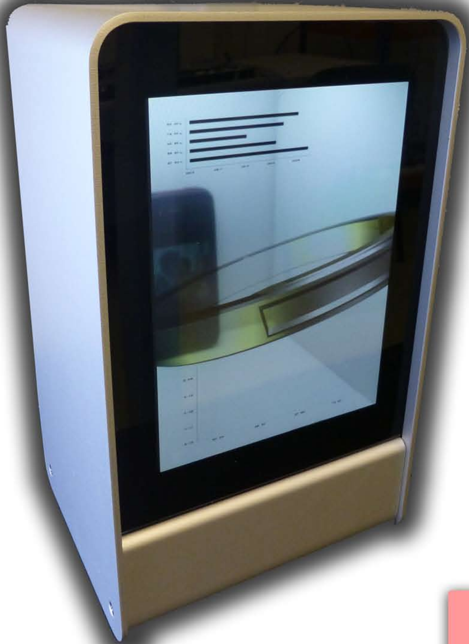
Alluminium Shell with glass Frontage