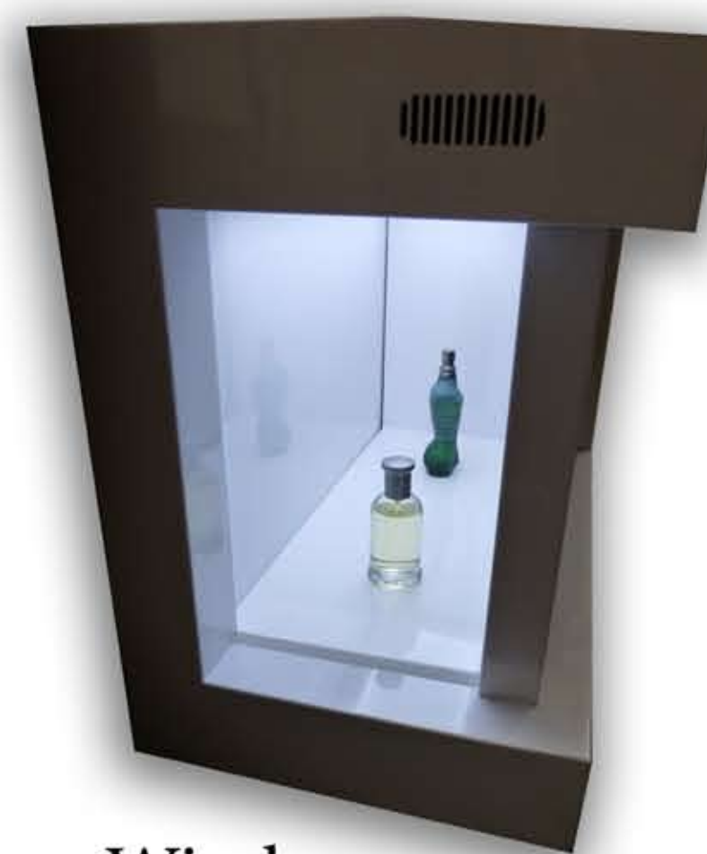
Side View Window